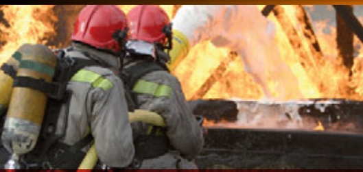
Foam concentrates & foam proportioning