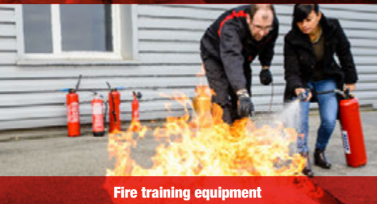
Fire training equipment