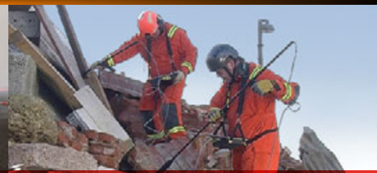
Search and Rescue equipment