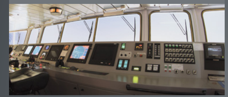
The A100 is the smallest, easiest to install and operate Class A on the market.