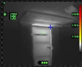
Use the Hot Spot Tracker to identify high-risk areas in the floor or ceiling, or to locate the seat of the fire,