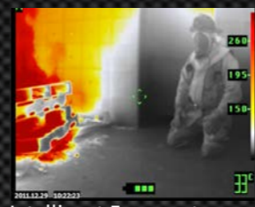
Intelligent Focus puts more control in your hands by allowing you to decide which scene details you want to see more of.